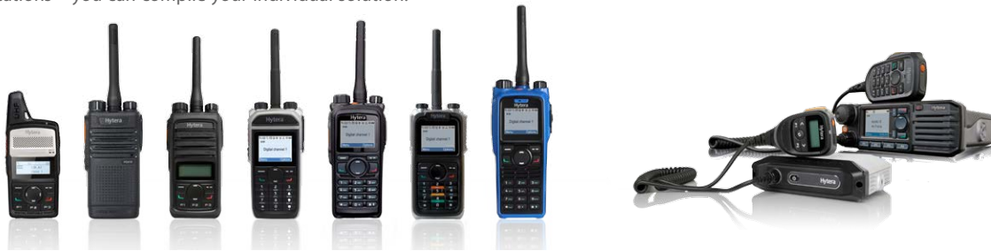
DMR radios with DMR Tier II support (selection)

Hytera offers you a complete product range for your simulcast mobile radio system: From infrastructure via mobile radios up to applications – you can compile your individual solution.