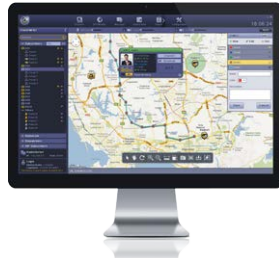
SmartDispatch / LDS