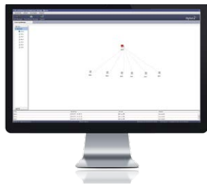
Network Management System (NMS)