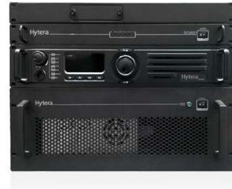
Base station with RD985S repeater in rack or for installation