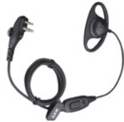
D-Earpiece with In-Line MIC & VOX EHM15