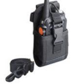
Nylon Carrying Case (Non-Swivel)(Black) NCN001