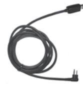
Programming Cable 2 Pin (USB) PC26