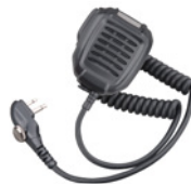
Remote Speaker Microphone SM08M3