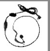
Earset with in-Line MIC EHM04