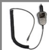
Vehicle Adapter for Charger CHV09