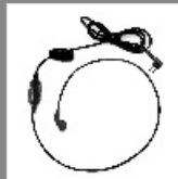
Earbud with in-Line PTT ESM02