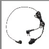
Earbud with on-MIC PTT ESM08