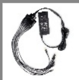
Six-unit Switching Power (for use with different power cords in different countries and areas) PS7002