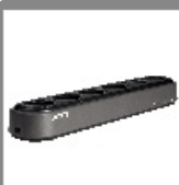
MCU Multi-unit Rapid-rate Charger (for Ni-MH battery) MCN05