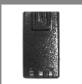
Ni-MH Battery (1300mAh) BH1302