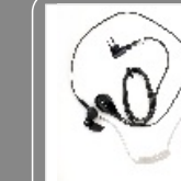
Earpiece with on-Mic PTT & Transparent Acoustic Tube EAM08